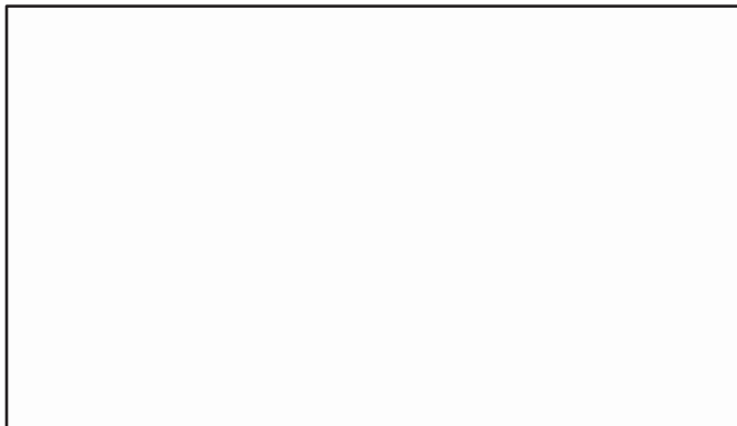
Copy of Social Security Card