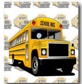
Approximately 25 million students ride on school buses every school day.

school zones. With the increasing number of children on the road, the responsibility is on drivers to be more aware.