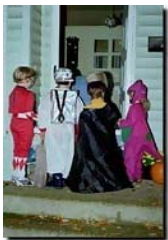
Children enjoying trick or treating door to door.

Trick-or-Treating should be one of the great adventures of Halloween for kids! They can get dressed in scary costumes and go door-to-door, begging "Tricks-or-Treats!" from neighbors or at the local mall. Lots of towns have a Fall Festival so kids can Trick-or-Treat safely. But going door-to-door is the stuff of childhood memories! It should be a fun