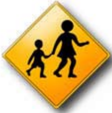
Motorist are reminded to use extra caution when driving through school zones.